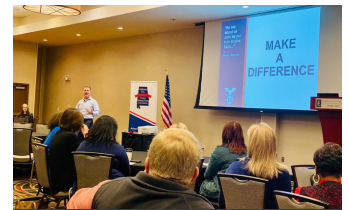
2023 ACCMA WINTER CONFERENCE!