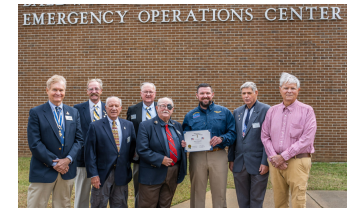
AWARD FROM THE SONS OF THE AMERICAN REVOLUTION

KMOB Radar Upcoming Downtime Outage: Jan 23 - Feb 4